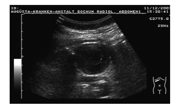
Fig. 1. Ultrasound of the gallbladder consistent with cholecystitis. Additionally sludge in the lumen (blue marks) and a light retention of effusion around the gallbladder was noted.

Renal Cell Carcinoma (RCC) is a rare tumour accounting for 3 % of all adult malignancies. It has a high